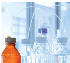
Solvents for HPLC