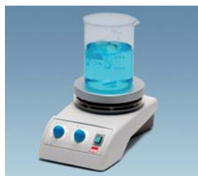
Rotilabo® Heating and magnetic stirrer MH15

► More information is provided in our Online Shop at www.carlroth.ch