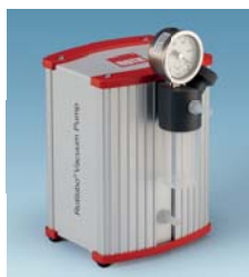
Rotilabo® diaphragm vacuum pump CR-MV100