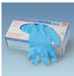
Rotiprotect® nitrile gloves eco